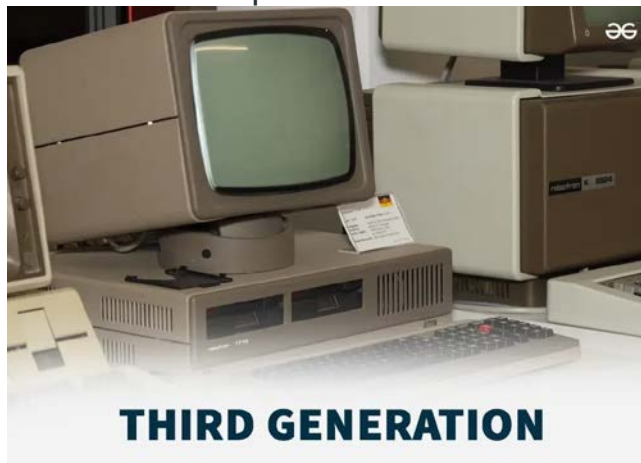
Third Generation Computers

During the third generation, technology envisaged a shift from huge transistors to integrated circuits, also referred to as IC. Here a variety of transistors were placed on silicon chips, called semiconductors. The most feature of this era's computer was speed and reliability. IC was made from silicon and also called silicon chips.